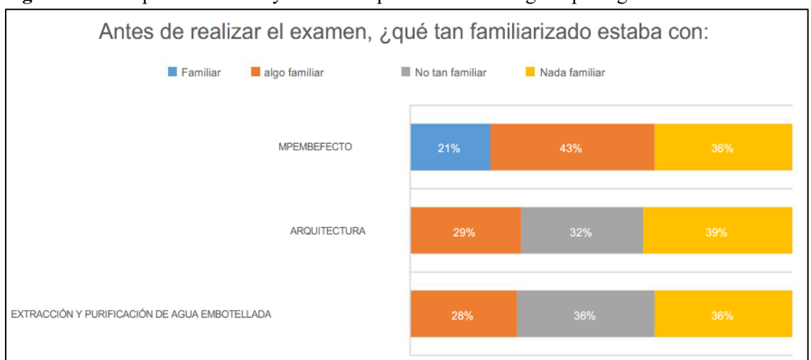
Figure 1. Participants' familiarity with the topics before reading the passages

The results of the survey composed of 14 questions were able to demonstrate the prior knowledge and familiarity that the students have with the topics presented, the following figures are shown below: