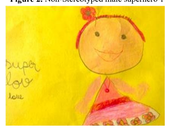
Figure 2. Non-Stereotyped male superhero 1

b. Students worked in groups to sort superpowers into categories for boys, girls, and both. Some placed strength with boys and love with girls, but after adding traits like friendship and care, they started reconsidering their choices.