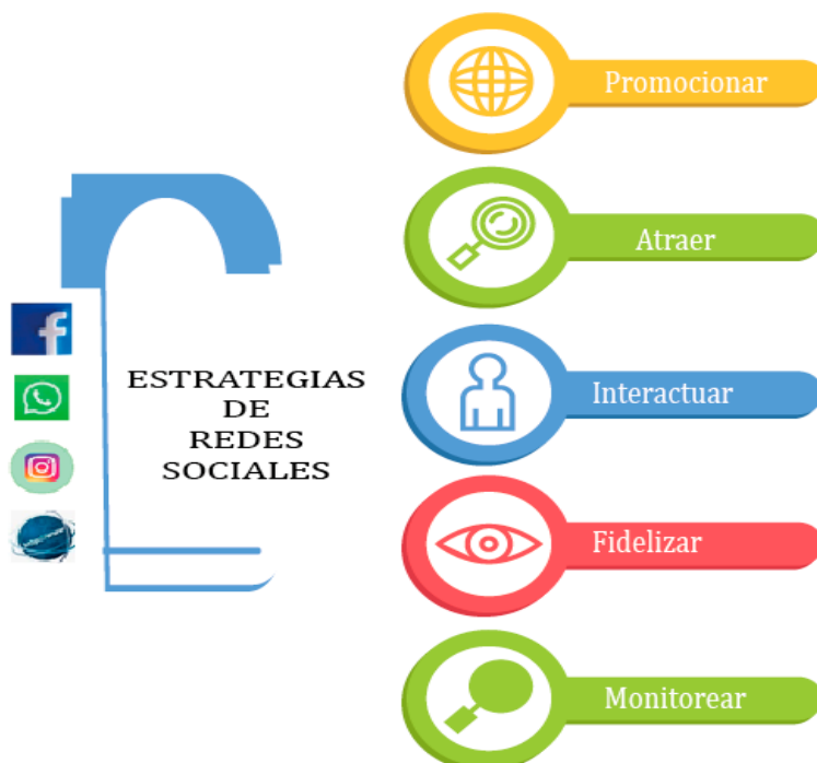
Figure 2. Social media strategy proposed by the author. (Romo-Jaramillo et al., 2020)

The social media strategy proposed in Figure 2 is developed in five phases: